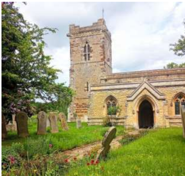
Cranford St John.